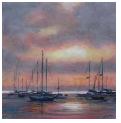
Study in Strata #3

approach to drawing drapery. She described basic rules