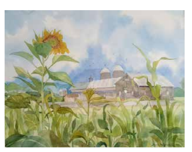
View Thru the Cornfield

The Artists of Studio 76 will be having a group show of recent works during the month of September at the Wm. K. Sanford Town Library in Colonie. An artist's reception, open to the public, will be held Sunday, September 10 from 2 to 4pm.