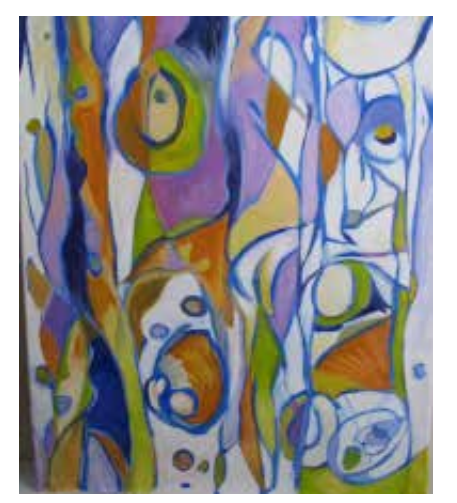
Through the Needles Eye

This painting got second prize ribbon at the Altamont Fair this summer.